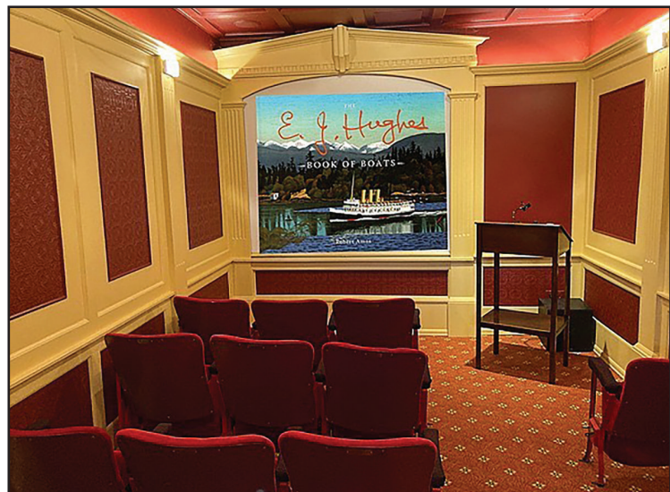
The Museum Theatre has many stories about Shawnigan for your viewing

We hope that our local museum will make you proud! Take a chance and check it out. The museum will re-open with regular hours on February 3rd.